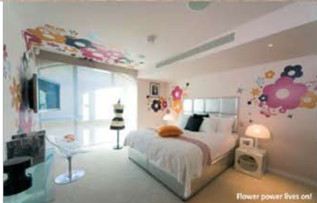
Flower power lives on!

The simple, refined interior is largely the work of Turner, whose 'home furniture packs' are offered to all Imagine Homes clients, and given this property's current status as a show home, the décor is intended as a demonstration of what they can expect from the company's services. There's no doubt that this well-appointed space is easy on the eye, but I've been told that there's bags of electronic trickery making up a powerful home entertainment system in here somewhere. Aside from a sleek, 50-inch wall-mounted flat-panel