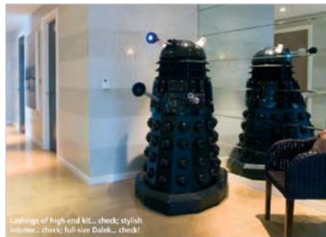
Lashings of high-end kit... check; stylish interior... check; full-size Dalek... check!

Occupying centre-stage in the right-hand column of the rack unit meanwhile, is a Kaleidescape media server system. Capable of storing around 3750 CD albums or 336 DVDs and linked to every TV in the apartment, it acts as a user-friendly, central repository for all of the family's recorded media. Navigation and browsing via the wireless Crestron controllers found in every room is, it must be said, simplicity itself. Using said controllers in conjunction with the living room's vibrant Vidikron plasma screen to browse movies by their cover art, is perhaps the best way to experience what the system is really capable of.